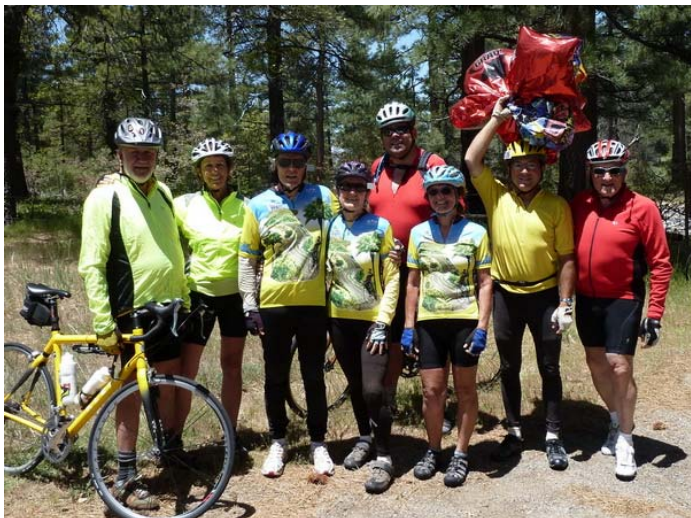
Mt. Laguna Slide – May 2011